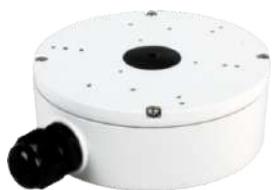
A22 JUNCTION BOX